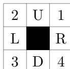
Figure 2: Encoding of pins by letters.

This encoding is summarized by Figure 2. The region encoded by 1 is called the first quadrant . The same goes for 2, 3, 4. The letters L, R, U, D are called directions , while 1, 2, 3 and 4 are numerals . An important remark is that the definition of pin words implies that they do not contain any of the factors UU, UD, DU, DD, LL, LR, RL and RR .