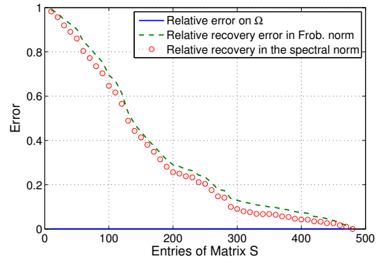
Fig. 2. Reconstruction error of S for the FPC algorithm.

Fig. 1 and Fig. 2 show the recovery error of the fingerprint map S based on SVT and FPC respectively, while we increase the number of the entries of S . Fig. 3 shows the cumulative distribution functions (CDFs, P(X < x) ) of the localization