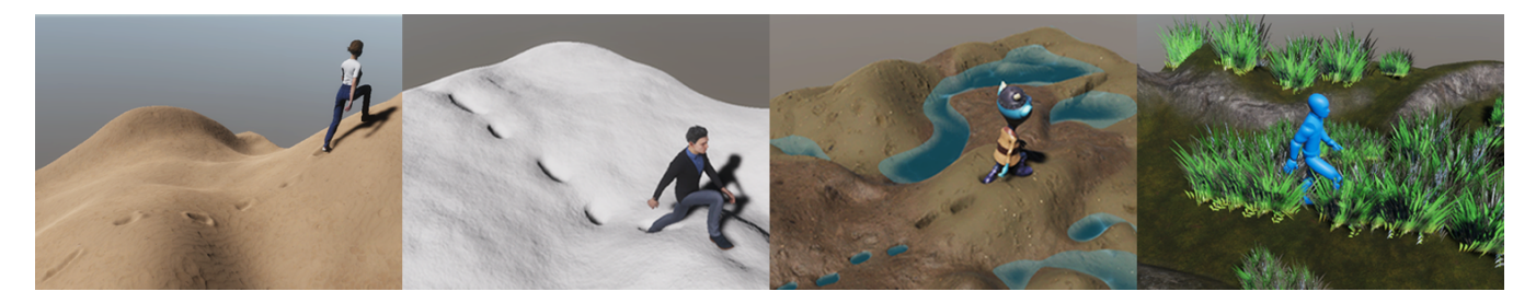
Figure 1: New layers added to a walking character in a game engine allow to automatically deform a variety of loose terrains and grass, using simple procedural parameters. Changes of gait that are consistent with this evolving environment are generated in real-time.

<sup>1</sup> LTCI, Télécom Paris, Institut Polytechnique de Paris <sup>2</sup> LIX, Ecole Polytechnique/CNRS, Institut Polytechnique de Paris