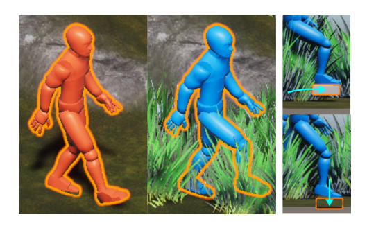
Figure 3: We use a moving platform (right) acting as a fake target ground for the foot, but suddenly moving down when hit, to model the presence of grass and its ability to be crushed.