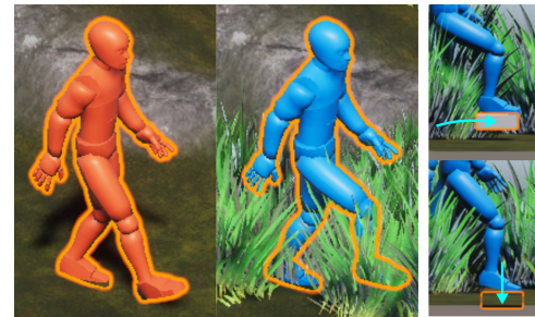
Figure 3: We use a moving platform (right) acting as a fake target ground for the foot, but suddenly moving down when hit, to model the presence of grass and its ability to be crushed.

The action of the feet on all geometric elements in such layer is handled using a procedural deformation, function of the distance to the walking foot: We choose to apply a translation t with linearly decreasing magnitude around the foot position p_f , computed at a