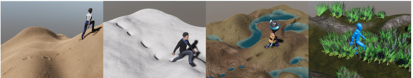
Figure 1: New layers added to a walking character in a game engine allow to automatically deform a variety of loose terrains and grass, using simple procedural parameters. Changes of gait that are consistent with this evolving environment are generated in real-time.

1 LTCI, Télécom Paris, Institut Polytechnique de Paris 2 LIX, Ecole Polytechnique/CNRS, Institut Polytechnique de Paris