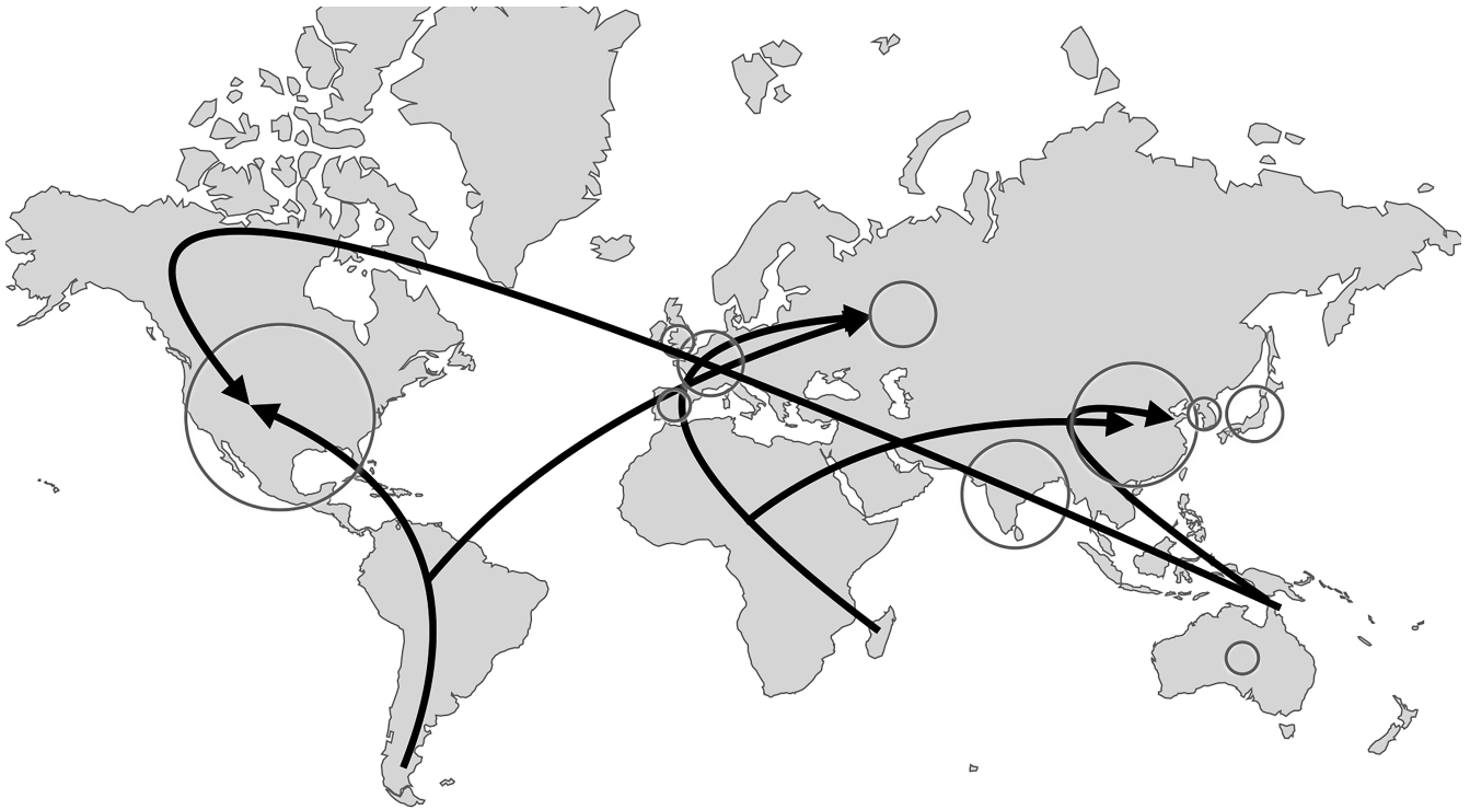
Fig. 1. Global flows of annotated data from micro-work providers to AI solution providers. Source: authors' elaboration.