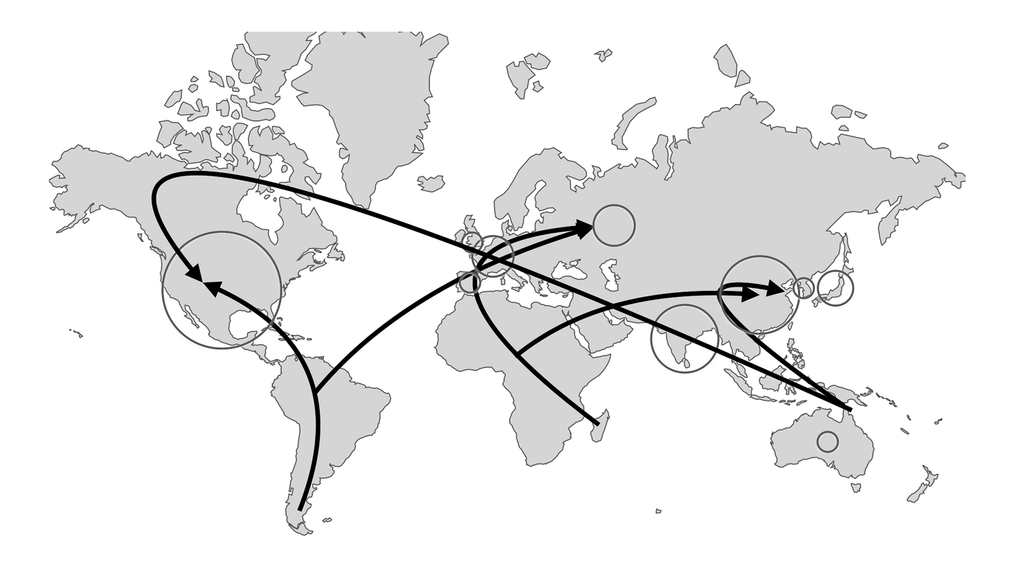
Fig. 1. Global flows of annotated data from micro-work providers to AI solution providers.