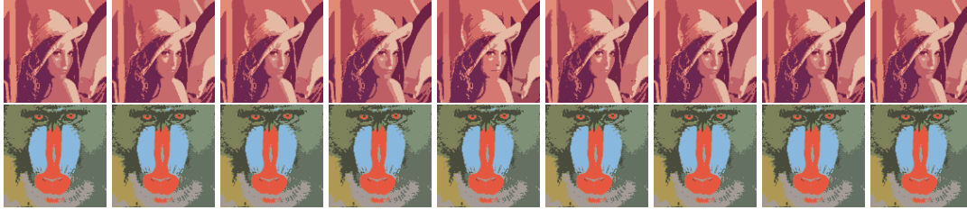
Fig. 2. Segmentation for \alpha in \{-1000, -100, -10, -1, 0, 1, 10, 100, 1000\} , for 8 clusters. All these images differ only by few pixels and are very similar to the one obtained with the Kullback-Leibler divergence ( \alpha = \pm 1 ).